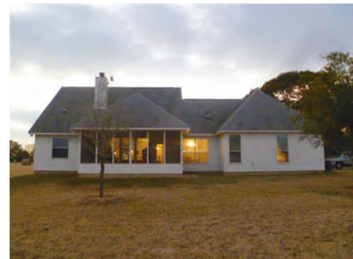
Screened porch to enjoy the morning sunrises