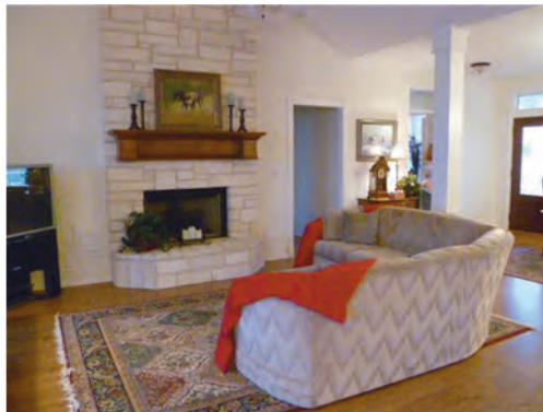
Comfortable living area is open to dining and kitchen