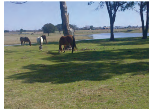
Pond and beautiful pastures for your horses and cattle