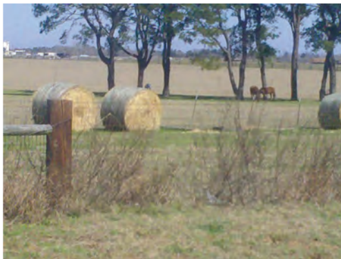
Improved pastures for excellent hay production